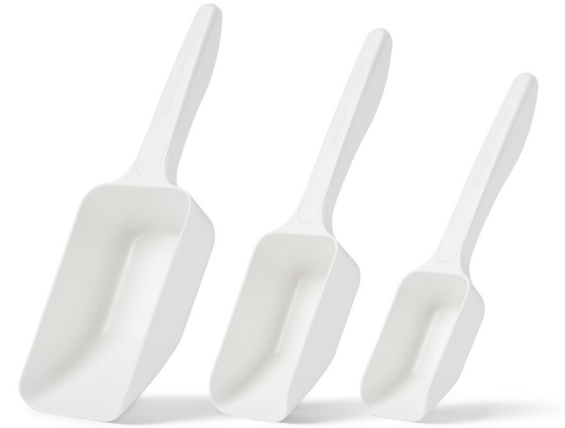
SteriTrue™ Sterile Sampling Scoops are available in three sizes.